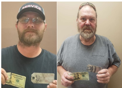
BIRP Tags are still out there ...